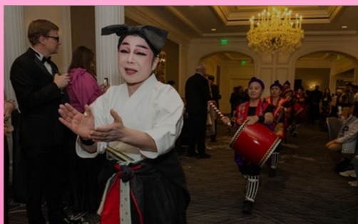
Asia Society Gala 2024