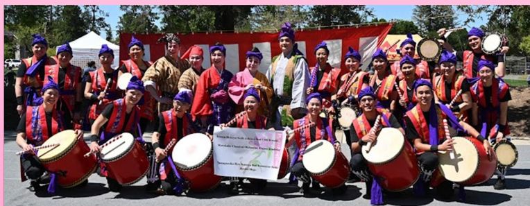
Cupertino Cherry Blossom Festival 2024

The word is out! Our Performing Arts or Geino-bu is finally getting the recognition it deserves! After many years of performing at the Northern California Cherry Blossom Festival and Grand Parade in San Francisco, the Cupertino CBF, and the San Mateo Japanese Festivals, they were recently selected to showcase Okinawan dance and eisaa taiko at the San Francisco Asian Art Museum, the 2024 Asia Society Gala and at the San Francisco Airport. It was quite an honor to participate in these high profile events in the Bay area. Great job to the entire group for all their hard work and practice! Here are photos of their recent performances.